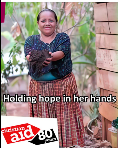
Holding hope in her hands

Today's Theme - Holding hope in her hands. Bible Passage: Amos 5 : 21-24 and Revelation 22 :1-5.