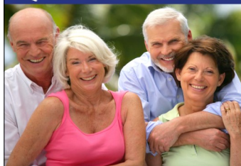
Retirement Living Exhibition

Silverbirch Hotel, Omagh Wed 25 Sept 2019 10am - 3pm