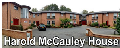
Harold McCauley House